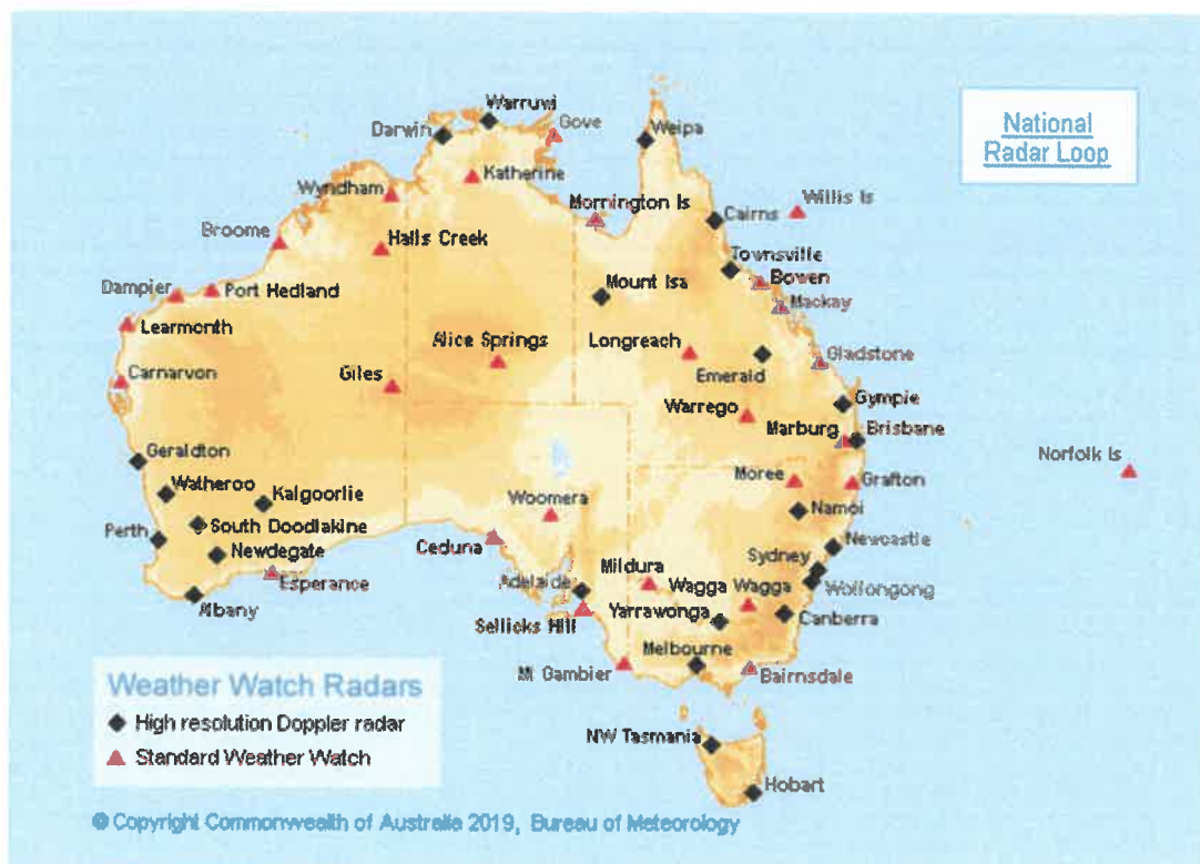
Figure 3 Current Bureau of Meteorology radar locations

To support this, it may be necessary for additional radar and other monitoring capabilities to be installed at key locations in WA. At present, there are no high resolution Doppler radars in WA north of Geraldton 37 .